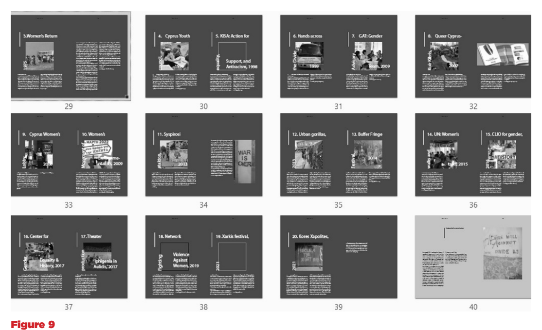
Catalog of womxn's action for peace. Catalog made by the author in "(RE)MAPPING NICOSIA: Women's agency in the contested walled city." Published at the Harvard Mellon Urban Initiative report.

Womxn use the walled city and its buffer zone to unite, organize, and plan actions for peace. Their initiatives inspired other multi-communal programs that engage citizens across class, gender, race, ethnicity, and sexuality. Their efforts take various forms, such as demonstrations, lectures, workshops, art festivals, conferences, and the formulation of solidarity groups. (Kotsoni, 2022) Their use of the walled city and the buffer zone as safe spaces opens up a new reading of these spaces that challenges the current narrative of their hostility because of the social