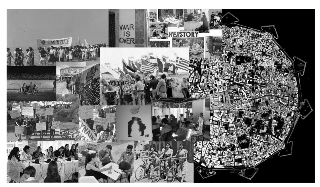
Figure 8 Examples of womxn's actions for peace. Collage made by the author.

The city, in this way, transforms into a place to be heard and a place that its inhabitants are fighting for. Marginalized groups were rarely given anything without struggle or a fight, neither freedom, rights, recognition, or resources. Sometimes this fight takes the form of a public protest. Likewise, feminist demands on the city take similar forms, such as collective protests. (Kern, 2020, p. 119) Marches and protests are often described as having specific characteristics that include the contestation of and resistance to power, bringing together a particular community, and being public in nature. Protests create a sense of community and de-functionalize the urban space "by interacting its usual business, transport, work, and specialization." (Awan, 2016, p. 79) By doing so, protests interrupt the hierarchical order of class society; they disturb the class relations between the diasporic bodies and their hosts. (ibid, p. 80) These marches increase the group's territory participating in it in the public space. It is not the scale of the protest that matters most but the audience—especially for womxn and marginalized groups, participating in demonstrations to create new and different experiences in the city. They take over the streets, link arms with strangers, and express their anger, joy, and solidarity. (Kern, 2020, p. 117) History has taught us that social change happens after some form of protest.