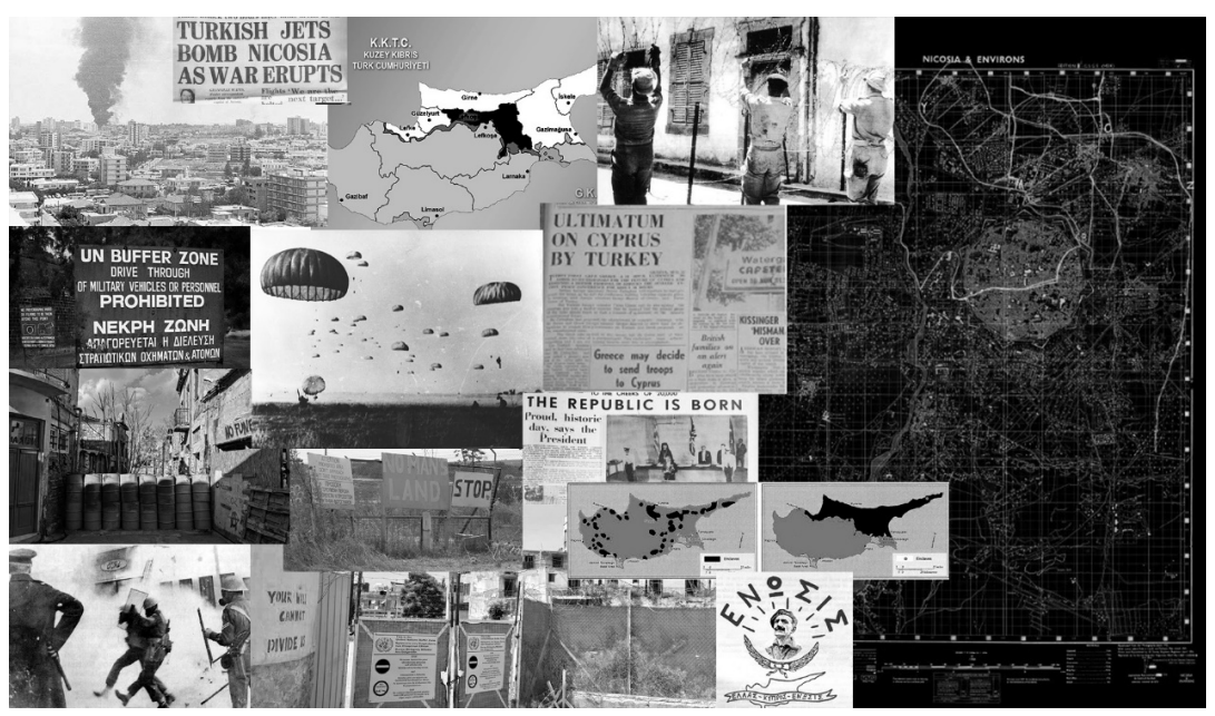
Figure 6 Collage of maps and photographs describing the Cypriot conflict in the press. Collage made by the author.

essential to reorient our gaze towards the drama embedded in the reality of every day and, in so doing, engage the shifting socio-political and economic domains that have been ungraspable by design. (Cruz, 2013) This viewpoint calls for addressing more local socio-political challenges by paying attention to everyday experiences.