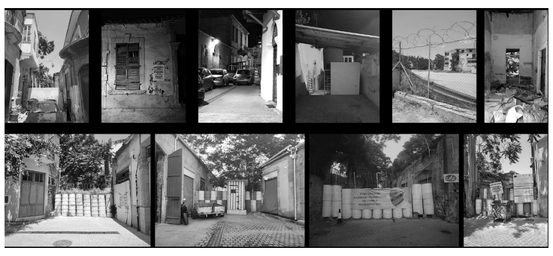
Figure 4 Buffer zone closings, including abandoned buildings, wires, and barrels.