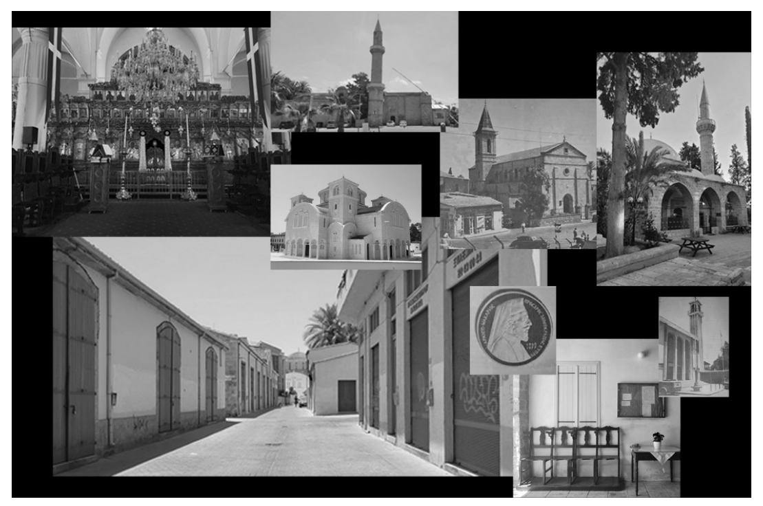
Figure 7 Religious spaces in Nicosia. Collage made by the author.