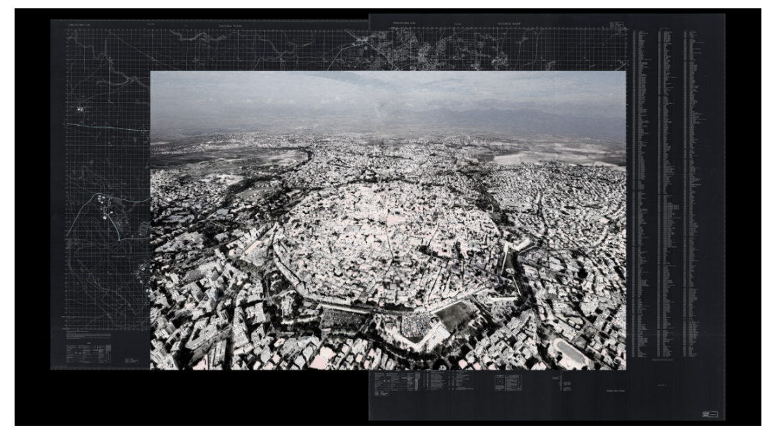
Figure 2 Nicosia today. Collage made by the author.

Nicosia is Cyprus's capital, administrative center, and most urbanized city (Brooke, n.d.). Historically, Nicosia has been the bridge for solving the Cyprus conflict, which is internationally referred to as the "Cyprus problem" (Cockburn 2004, p. 10). Before the division, the two main ethnic groups in Cyprus, the Turkish-Cypriots (TC) in the north and the Greek-Cypriots (GC) in the south, coexisted in peace, despite their social, political, and cultural differences. Colonial forces and the ethnic division between TC and GC resulted in nationalistic sovereignty claims, which led to Cyprus's territorial division in 1974 to reduce the tension between the two communities (Brooke, n.d.). After the war, the GC put pressure for Enosis; the union with Greece, resulted in 1955 to the collapse of the peaceful coexistence of the two communities; for the first time, the TC demanded partition to protect their rights. In 1959, GC and TC fought against the British colony, leading in 1960 to the recognition of Cyprus as an Independent Republic with autonomy and democracy and asserting its sovereignty as a member of the United Nations and the Council of Europe. This agreement excluded both Enosis and partition.