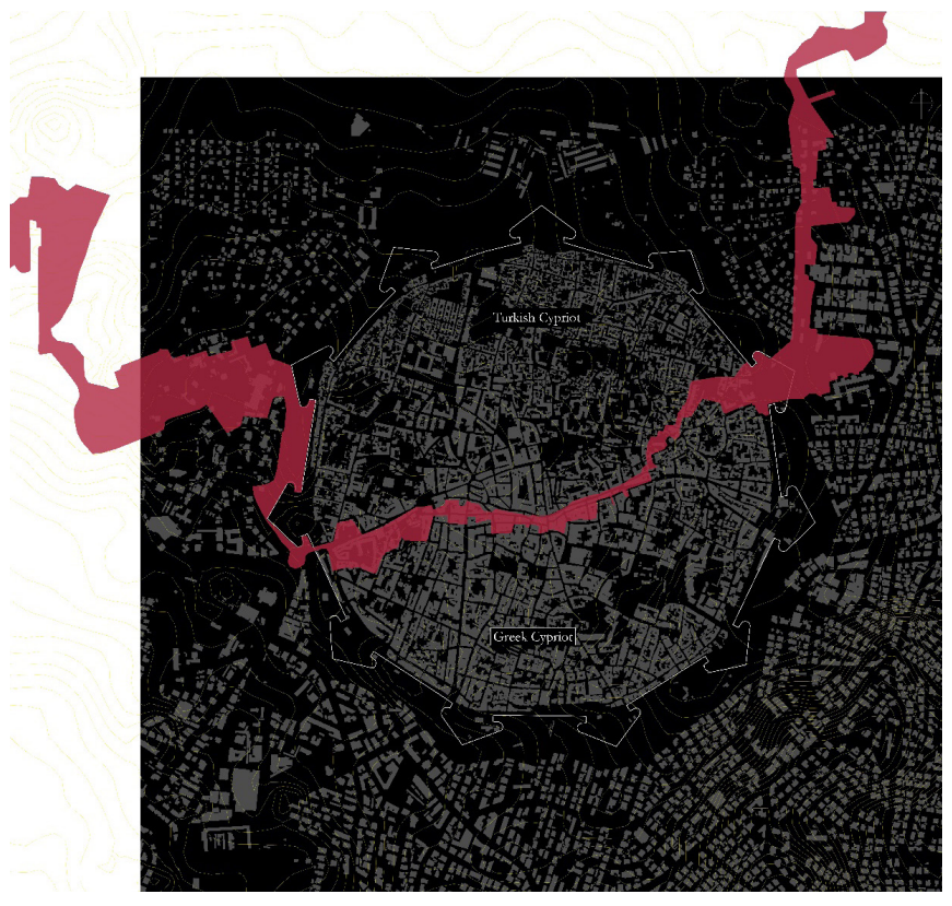
Figure 1 Map of Nicosia with highlighted buffer zone.

Cities are complex environments highly shaped by marginalized communities who are constantly claiming their agency and space to thrive. However, these marginalities are either obscured or absent in the design and planning disciplines. This article focuses on the divided city of Nicosia in Cyprus, one of the last divided capitals in the world, where several communities coexist in its contested space. Nicosia is analyzed in terms of how womxn across the divide coexist and raise their voices for peace. Womxn's actions shift the geopolitical focus of Nicosia's territorial conflict to a social territory reproduced by their bodies while navigating the city's quotidian. This article suggests that designers and planners should develop intersectional lenses to identify marginal forces that shape the city and better understand urbanization in contexts of ongoing conflict. To acquire an inclusive viewpoint, one needs to shed light on absent or obscured voices by recording diverse perspectives, especially of womxn and people of minoritized genders. Mapping from the margins can help designers and planners understand how these informalities work and build a more profoundly democratic practice.